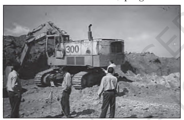
Fig. 9.2 : Noise monitoring at Panchpatmalai Bauxite Mine

The main sources of noise pollution are various factories, mechanised construction and demolition works, automobiles and aircraft, etc. There may be added periodical but polluting noise from sirens, loudspeakers used in various festivals, programmes