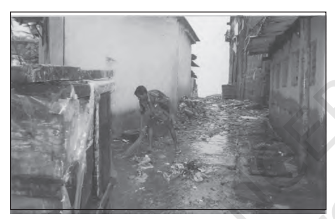
Fig. 9.3: A view of urban waste in Mahim, Mumbai