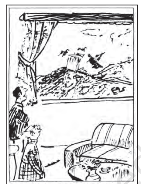
I moved into this second floor from the first to get a view of the sea and the garbage has piled up to this level obstructing the view.

Urban waste disposal is a serious problem in India. In metropolitan cities like Mumbai, Kolkata, Chennai, Bengaluru, etc., about 90 per cent of the solid waste is collected and disposed. But in most of other cities and towns