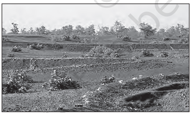
Fig. 9.4 : Trees planted on Common Property Resources in Jhabua

An interesting aspect of this experience is that before the community embarked upon the process of management of the pasture, there was encroachment on this land by a villager from an adjoining village. The villagers called the tehsildar to ascertain the rights of the common land. The ensuing conflict was tackled by the villagers by offering to make the defaulter encroaching on the CPR a member of their user group and sharing the benefits of greening the common lands/pastures. (See the section on CPR in chapter 'Land Resources and Agriculture').