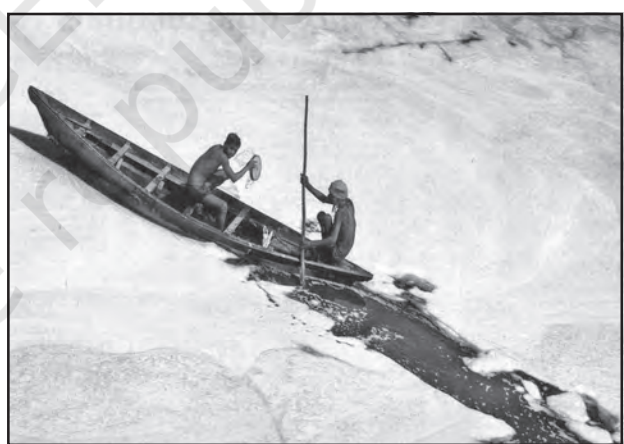
Fig.9.1 : Cutting Through Effluent : Rowing through a pervasive layer of foam on the heavily polluted Yamuna on the outskirts of New Delhi

Indiscriminate use of water by increasing population and industrial expansion has led degradation of the quality of water considerably. Surface water available from rivers, canals, lakes, etc. is never pure. It contains small quantities of suspended particles, organic and inorganic substances. When concentration of these substances increases, the water becomes polluted, and hence becomes unfit for use. In such a situation, the self-purifying capacity of water is unable to purify the water.