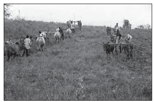
Fig. 9.5 : Community Participation for Land Leveling in Common Property Resources in Jhabua (ASA, 2004)

Source: Evaluation Report, Rajiv Gandhi Mission for Watershed Management, Government of Madhya Pradesh, 2002